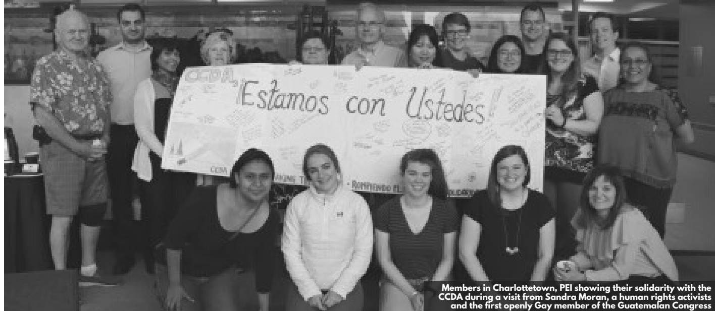
Members in Charlottetown, PEI showing their solidarity with the CCDA during a visit from Sandra Moran, a human rights activists and the first openly Gay member of the Guatemalan Congress

From human rights accompaniment and on-the-ground presence with BTS partners, to initiating a new Cooperant Program, BTS stands in solidarity with genocide survivors and communities impacted by Canadian mining companies.